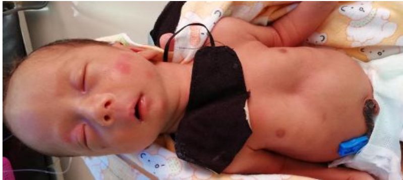
Figure 3 : Pectus excavatum