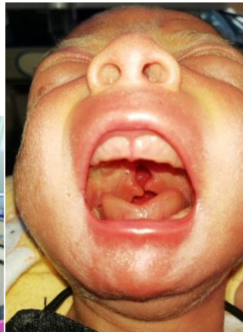
Figure 2: Cleft palate